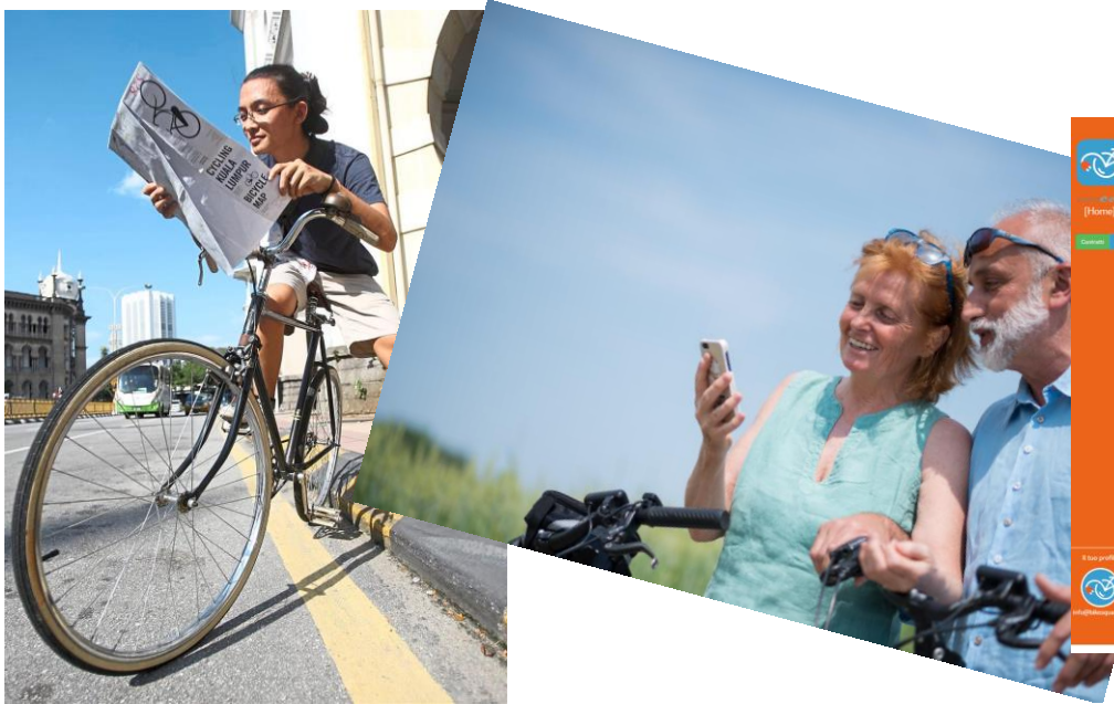
La dashboard BikeSquare